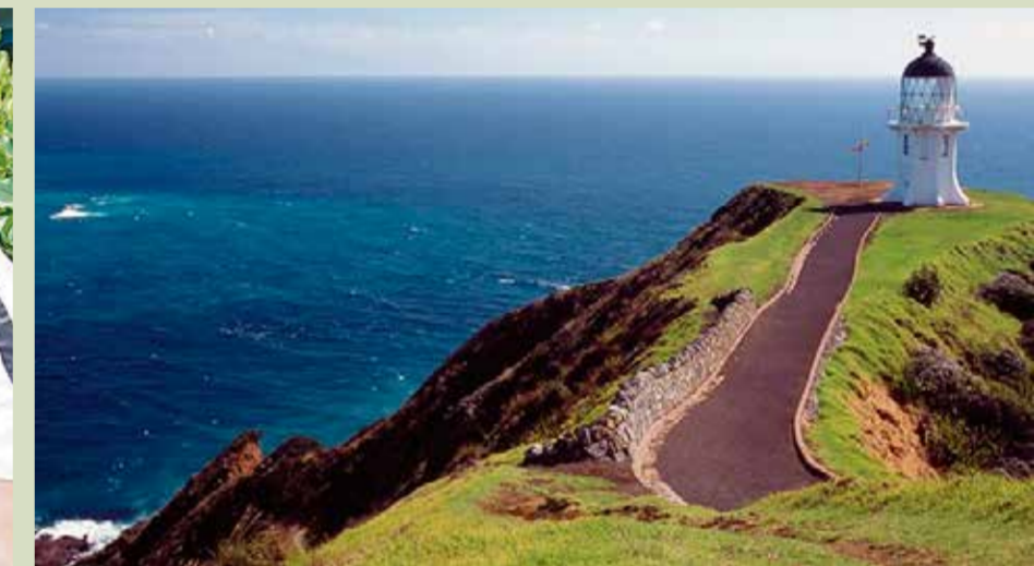
Cape Reinga Lighthouse